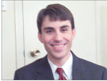
NAME: GORDES AGE: 28 YEAR-OLD PROFESSION: MARKET MAKER

He works in Tokyo for a high-profile brokerage firm. A natural leader, he enjoys his busy successful career. But he misses his clique who had been the real friends along all these years. Last year, he missed the annual reunion in Diablerets at Cecilia's parents country house because of his work. He used to live in New York before being sent to Tokyo. At that time he used to see his clique more often. Tokyo is a bit far for all of them to get together.